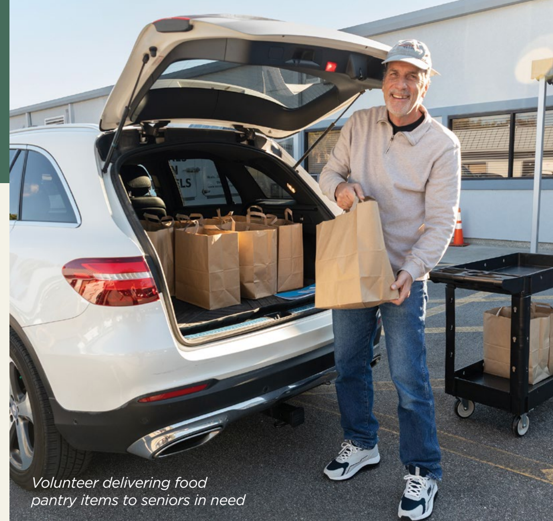
Volunteer delivering food pantry items to seniors in need

A total of 15,867 hours of comprehensive care was provided through our Adult Day HealthCare program, “The Club,” including speech, physical, occupational, and mental health therapies.