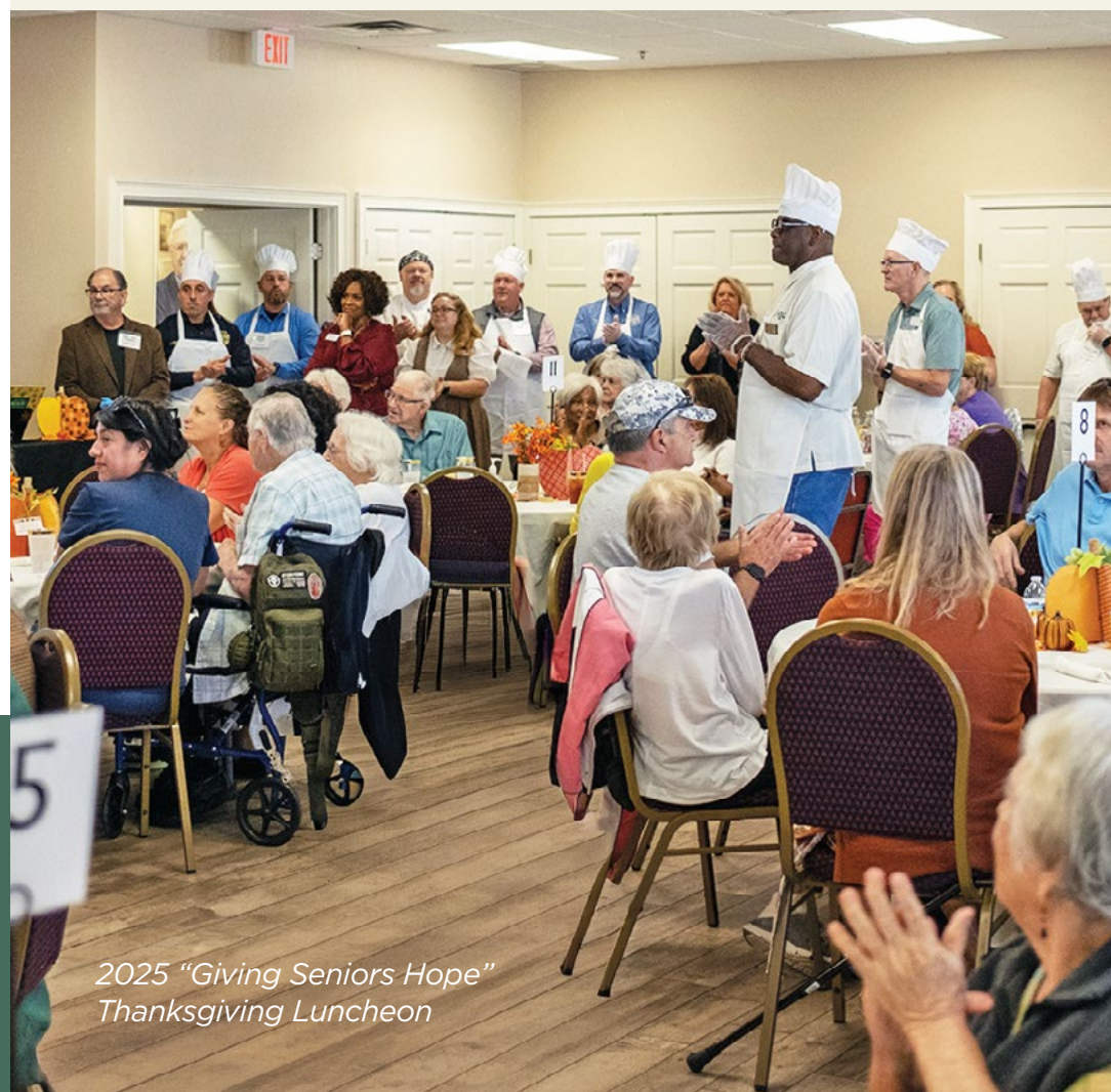
2025 “Giving Seniors Hope” Thanksgiving Luncheon